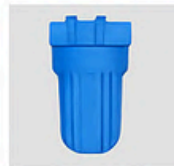
Sediment Filter Housing