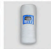
5 micron sediment filter