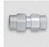
Hose Bib Assembly